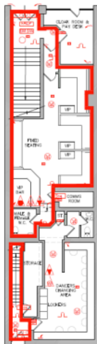
PROPOSED GROUND FLOOR PLAN @1:100